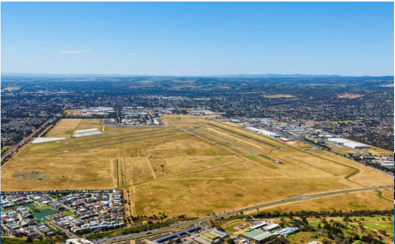
Figure 1 – Parafield Airport (from Parafield Airport Master Plan)

Community consultation meeting 6:00 pm on Wednesday 15 April 2026, details page 12