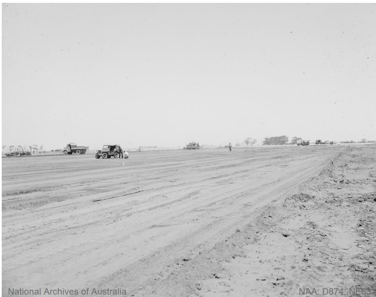
Figure 2 –Works progress - Parafield airstrip 1952, NAA D874, NE63