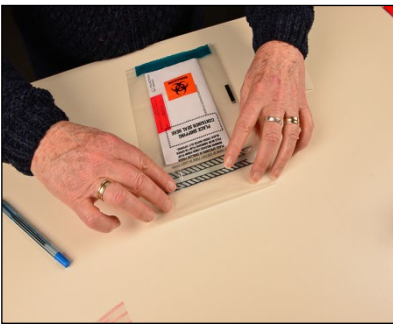
Photo 10: Seal the envelope inside the supplied plastic bag. DO NOT FOLD THE ENVELOPE

Note: The unique donor ID number must be recorded on the envelope Collection site refers to where the hair was collected from eg: head, under-arm etc.